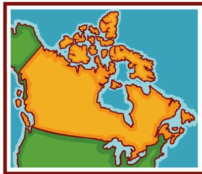
It's in North America