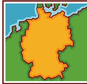
It's in Europe