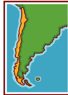
It's in South America