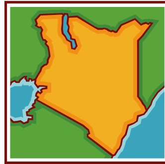
It's in Africa