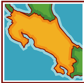
It's in Central America